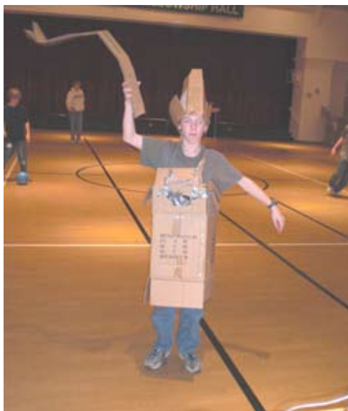
2010 30-Hour Famine Fun!